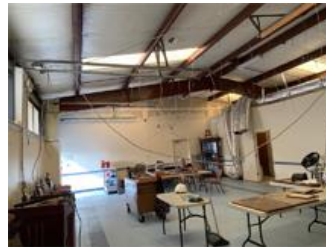
1 st week of renovations